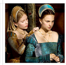
Rival Sisters Duke It Out for the Passion of a King